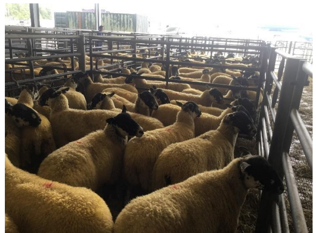
North Country Mule Theaves to £151