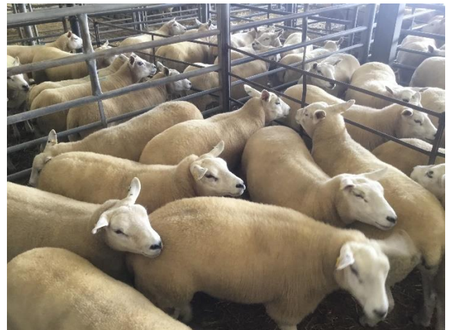
Texel Theaves to £202