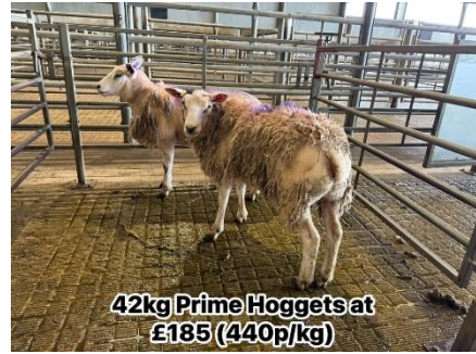
42kg Prime Hoggets at £185 (440p/kg)