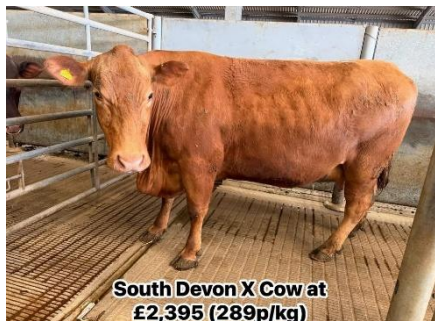
South Devon X Cow at £2,395 (289p/kg)

BARREN COWS & OTM CATTLE (14) Strong South Devon cows sold to 289p/kg £2395 & 280p/kg £1900 from M/s Ellipsis Farms. A run of Belted Galloway cattle from M/s National Trust saw cows to 278p/kg £1526. Their overage steers sold to 320p/kg £2061 & 318p/kg £2080 with all between 290 – 310p/kg. Cull bulls sold to 226p/kg £2165 for a Sussex from M/s R & J Burr.