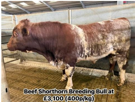
Beef Shorthorn Breeding Bull at £3,100 (400p/kg)

A few nice breeding bulls saw a pedigree Beef Shorthorn to £3100 from M/s S Horton & Son, Poulton. A strong pedigree Aberdeen Angus sold to £2800 from M/s P & T Reynolds, Chippenham & a pedigree Limousin to £2700 from M/s D & A Dando, Old Sodbury.