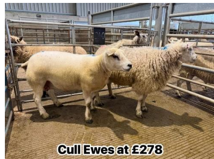
Cull Ewes at £278

CULL EWES (201) The trade has eased nationally but still remarkably good and our trade up with the best of them. The few best ewes traded to £278 from Mr P Baker & £272 from M/s D T & R M Williams & Son. The stronger Continental & Suffolk ewes were all over £200 with most £210 - £230. The next level looking well sold between £175 - £190. The Mules saw the stronger medium sorts to £170 with the half meated ewes £140 - £160 & the next level £120 - £130. The stronger medium ewes also looked well sold between £150 - £165 & the half meated ewes £130 - £140. The small hill bred ewes saw the meat trading between £100 - £120, mediums £75 - £90 and plain £50 - £65. The plainer ewes were again another good trade with the bigger framed sorts £100 - £120 & mediums £90 - £100 and even the very plain £60 - £80.