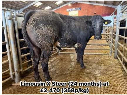
Limousin X Steer (24 months) at £2,470 (358p/kg)