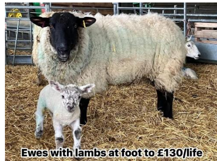
Ewes with lambs at foot to £130/life

EWES & LAMBS (40 & 62) A nice entry saw the few stronger sorts well sold with doubles to £360 (£120 a life) from Mr N Ponting. Ewes with younger lambs were £100 - £110 a life with singles to £260 (£130 a life), £245 (£122.50 a life) & £240 (£120 a life) from M/s Allspheres Farm.